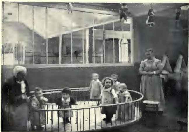
Fig. 21. DELBRÜCK'S BABY-CAGE.

children to walk, presses the chest of the child as it strives to go forward, and does not teach it the art of balancing itself, in the acquisition of which the whole secret of walking lies. In the Familistère they use an apparatus called "Delbrück's Baby-cage," from the name of its originator. A double circular railing composes the whole of this very simple contrivance, as may be seen in Figure 21. The child supports itself by resting both hands upon these two